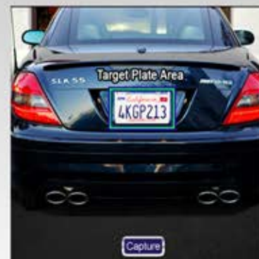
Plate capture is simple. Position the license plate inside the box and hit Capture. This app is perfect for special events such as motorcycle rallies and other environments where traditional LPR is not an option.

Mobile Companion's interface is incredibly intuitive, and is synchronized with the user permission matrix and auditing requirements set by the Agency Manager.