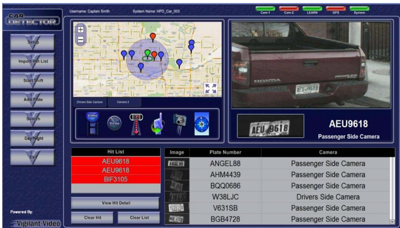
Typical Mobile Hit hunter - CarDetector GUI

MHH is a 'next generation' product feature created to help public safety professionals utilize the CarDetector Mobile ALPR System (CDMS) more effectively with greater much results. The MHH as part of the CarDetector mobile LPR software application, provides the patrol vehicle operator with data intelligence access to vehicle locations of wanted suspects known to be previously located within two (2) miles of their current location. The MHH operator easily navigates a street map leading right to the vehicle location of a wanted vehicle of interest.