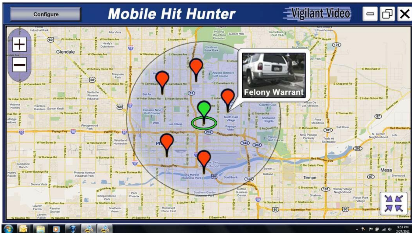
Typical MHH feature with NVLS criminal Hits - Full Screen Application Mode

Real World Scenario: A Vigilant Solutions LFO scans a parked vehicle with plate number 'ABC123'. That record is then transferred to the LEARN-NVLS data server. Once received by the server, the Detection record is matched against a Hot-List record of Agency 'A' corresponding to an outstanding Felony Warrant want of the registered driver. This vehicle may be located far from the registered address but may be frequenting another location where scanned by the LFO. An officer of Agency 'A' is operating the Vigilant Solutions CarDetector LPR system with the MHH feature active, and drives within two (2) miles of the located Felony Warrant vehicle want. Immediately an alert will sound within the vehicle and a red 'Tic' mark will appear on the map (as shown above). The officer may verify the Hit and pull up all pertinent LPR data associated with the MHH 'Hit' record and then decide to take the necessary actions of apprehension.